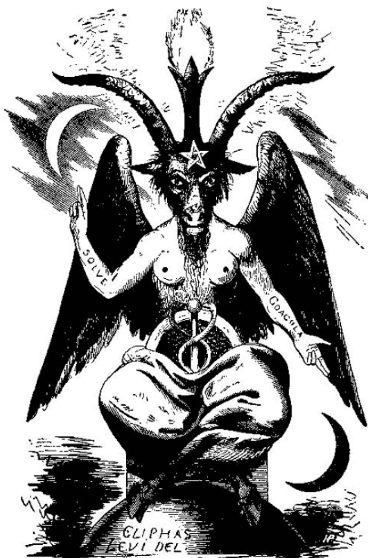
THE SABBATIC GOAT