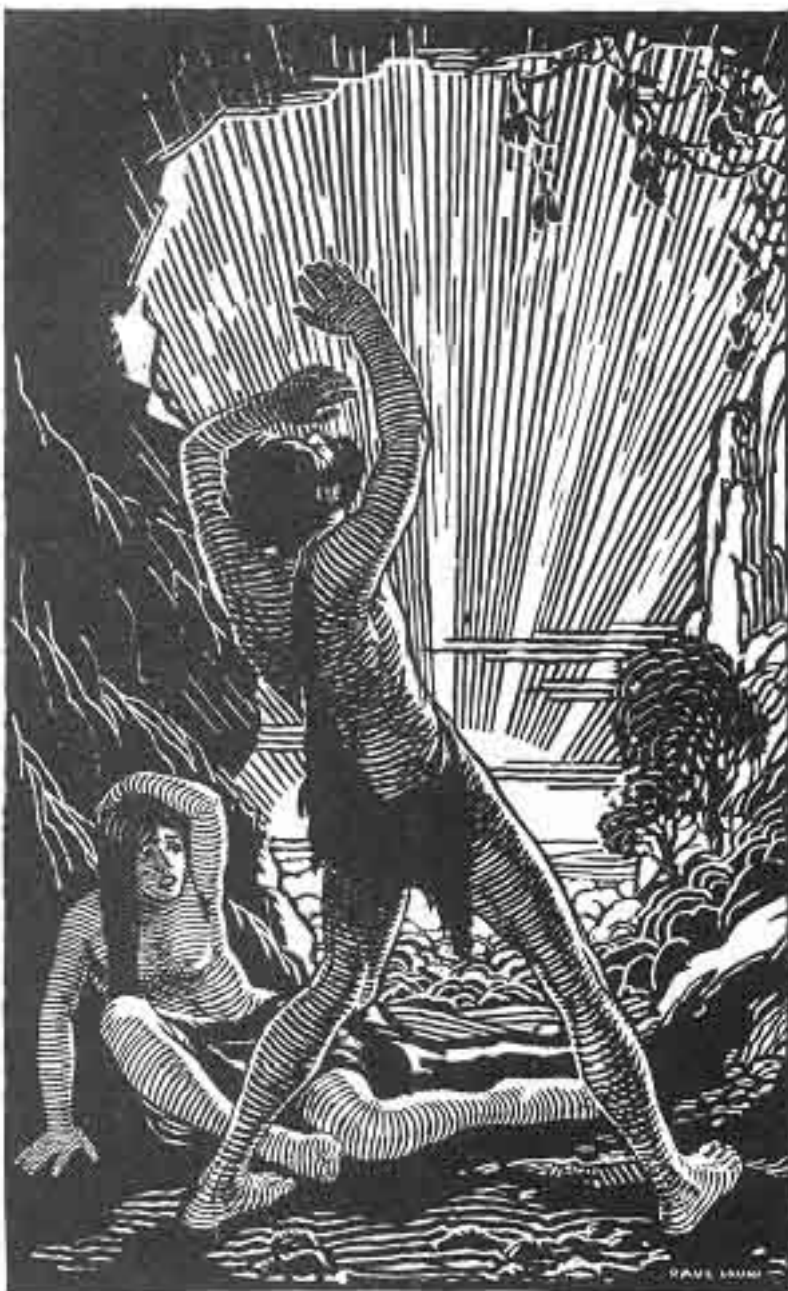
THE FIRST SUNRISE