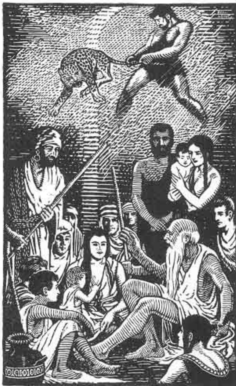
JUDAH REVEALS THE STORY OF HIS LIFE