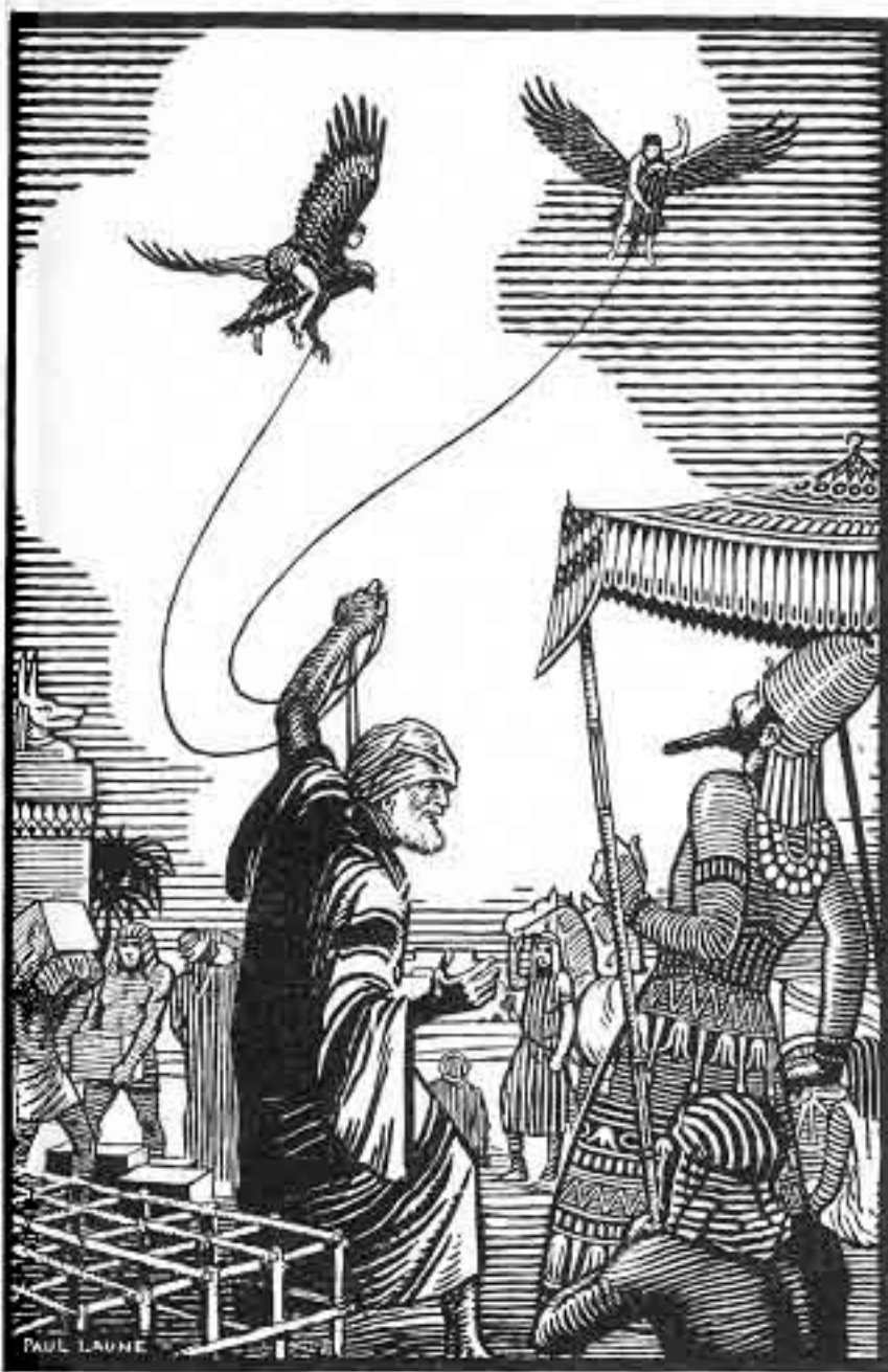
AHIKAR ANSWERS PHARAOH'S RIDDLE