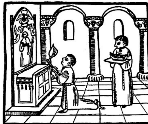
The two clerks offering the leaf at St. Columcille's altar