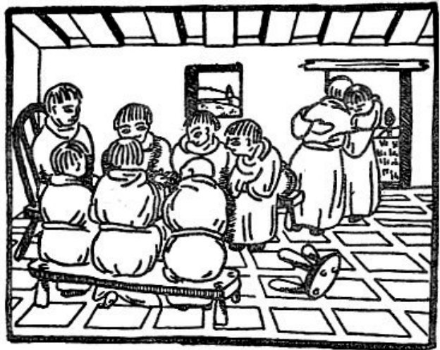
The meeting hostile to St. Columcille