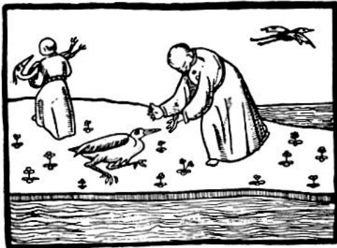
The Crane from Ireland