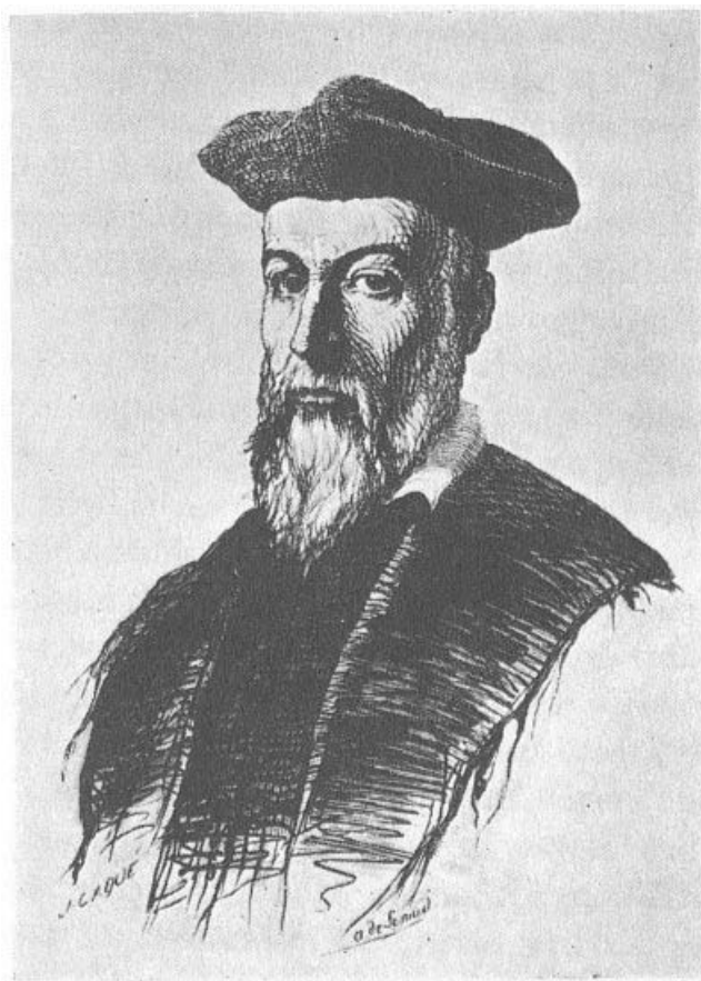
Etching made by a woman of Salon, from the portrait bust by César Nostradamus, son of the prophet.

THE NEW FREEDOM which had lured Doctor de Nostradame from Montpellier's halls was providing the kind of activity he liked best. His success had made him the rage throughout southern France. People were clamoring for him, requesting his attendance on their ills, inviting him to be their guest, for months if he would. Important doors were invitingly open. Everyone wanted to know the current sensation because he was charming, modest and had a great future. Besides, plagues had a way of returning, it was well to stand in with the only man who could cope with them. So Doctor de Nostradame, combining business with pleasure, travelled about from city to city, attending a patient in Avignon, stopping off for a visit in Salon, and moving on to Marseilles to answer new calls.