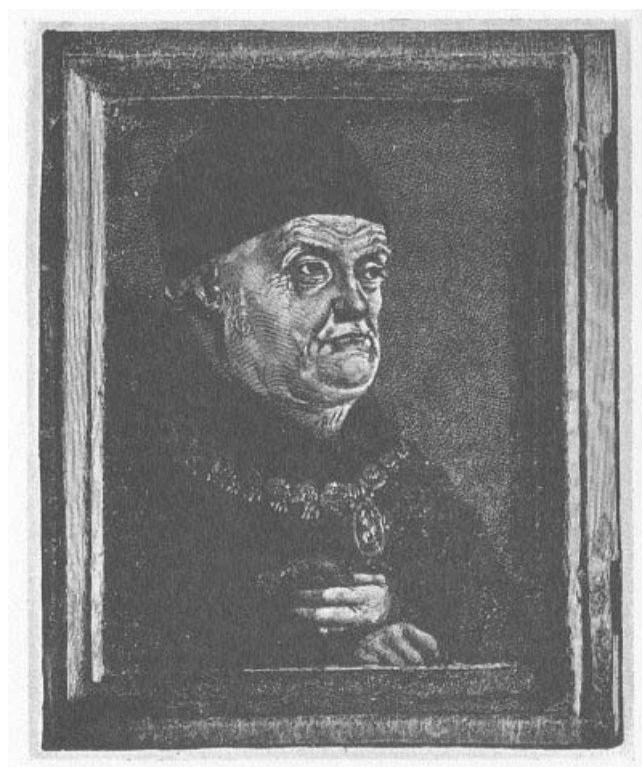
King René, the minstrel-monarch of Provence

TIME WORE ON. The fruit of the prophet's nocturnal visions multiplied enormously as the history of events to come unfolded its vast stretches before his eyes. Nostradamus, in common with most men of genius, began to feel the urge to share his vision with the world. Yet he knew he would have to move very cautiously in presenting his work to the public. Its peculiar nature made necessary all possible safeguards against suppression or destruction not only during his own lifetime but in the future centuries with which his prophecies were concerned. His plans must be carefully made, there must be no mistakes.