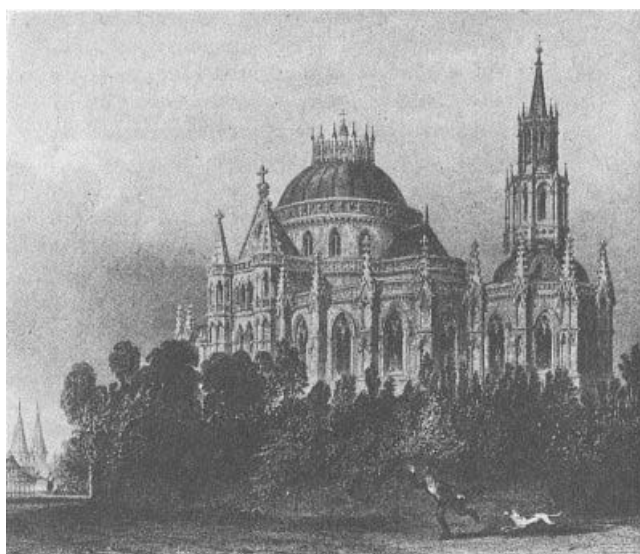
Last resting place of the older Capetian kings

NEARLY THREE MONTHS had gone by from the time that Nostradamus had left Salon, to his return, laden with gifts and the honor of the King's appointment. It was a great day in the life of the little town when he came back to his people with laurels of this new adventure. Family and friends rejoiced at his success. His triumphs, though pleasing to Nostradamus, made no difference in his way of life. As soon as he had rested up he resumed the busy even tenor of his days as if Paris had never called him.