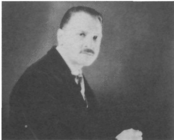
Somerset Maugham-MI6 special agent to Kerensky.