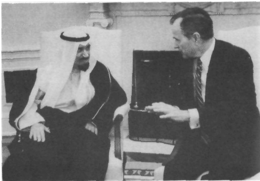
Former U.S. President Bush and Emir Al-Sabah.