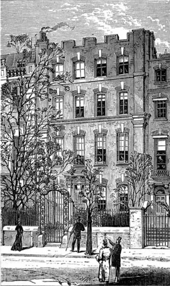
Cheyne Walk in Chelsea, London, brief home of George Eliot.