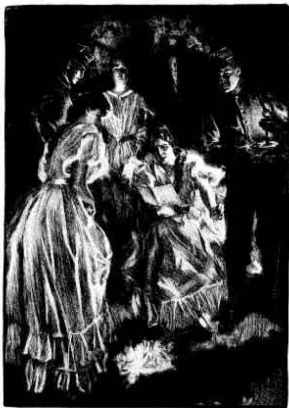
Springing to the ground between our two candles, she bent over the open page

"Sweet heart," replied Miss Harper, "very good! very good! but now say no more of that sort. God bless you, dear, just let yourself be happy. Good-night--no, no, sit still; stay where you are, love, while Camille and I go in and Richard steps