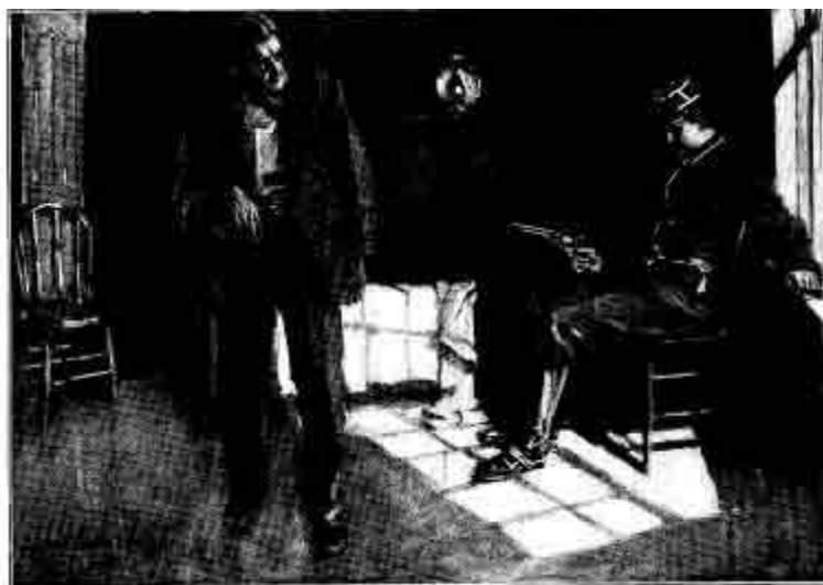
"Well, you air in a hurry!"

I put on an offended esteem. "My dear sir, you've no call to take offence at me. I'm waiting because my business is too--well, if I must explain, it's--it's too important to be risked except by good safe daylight; that's all."