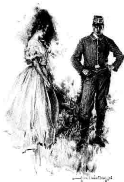
"Don't you like him?" she asked, and tried to be very arch.

and said it explained some things in her which nothing else could excuse! Wasn't that funny!--oh, pshaw! it doesn't sound a bit funny as I tell it, but she said it in such a droll way! She was so full of fun and frolic that day! You can't conceive how full of them she is--sometimes; how soberly she can say the funniest things, and how funnily she can say the soberest things!"