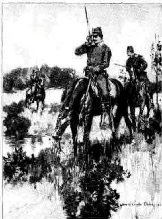
Ferry saluted with his straight blade.

"I admit you are quite able to cross without."