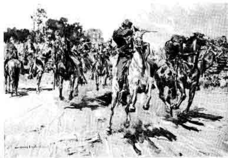
With the rein dangling under the bits he went over the fence like a deer.

"You have no carbine," said my commander. "And you have but one revolver; here is another."