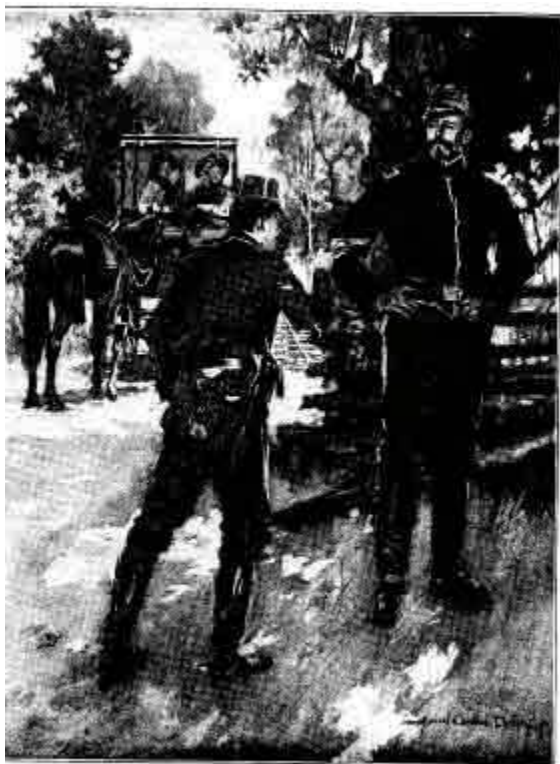
"I surrender," he said, with amiable ease.

"Halt!" We halted. "About face!" As the prisoner eyed me both of us listened. His equanimity was almost winsome, and I saw that friendliness was going to be his tactics.