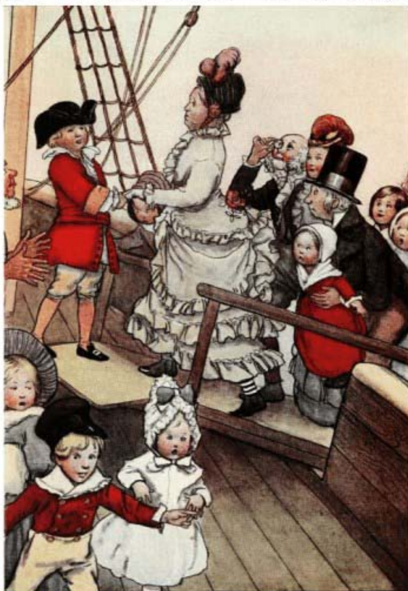
"Invited them to Breakfast"