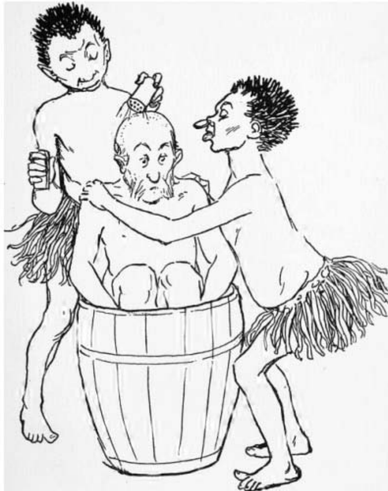
"Two Savages Floured Him Before Putting Him To The Fire."

Turtles and oysters were now produced in astonishing numbers, and on these and yams the people made a hearty meal. After dinner the Chief told Captain Boldheart that there was better feeding up at the village, and that he would be glad to take him and his officers there. Apprehensive of treachery, Boldheart ordered his boat's crew to attend him completely armed. And well were it for other commanders if their precautions—but let us not anticipate.