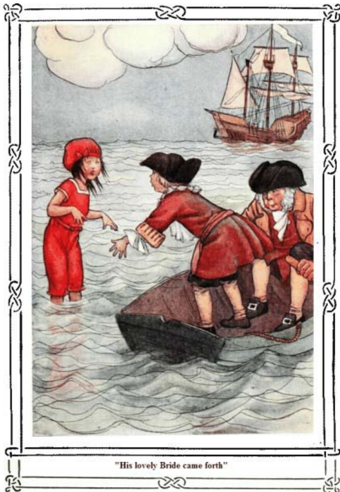
"His lovely Bride came forth"

"Captain," said the Mayor, "I have ascertained that the young lady is going to bathe. Even now she waits her turn for a machine. The tide is low, though rising. I, in one of our town-boats, shall not be suspected. When she comes forth in her bathing-dress into the shallow water from behind the hood of the machine, my boat shall intercept her and prevent her return. Do you the rest."