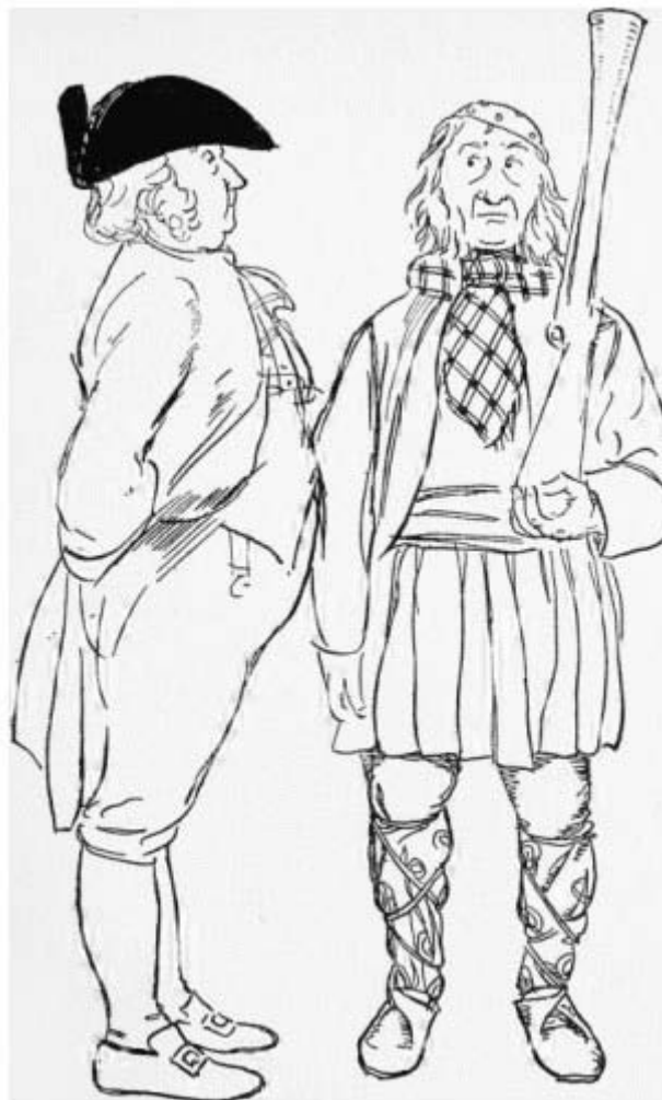
Standing Sentry Over Him

The Mayor begged for two hours' grace, in which to make inquiries respecting the young lady. Boldheart accorded him but one; and during that one placed William Boozey sentry over him, with a drawn sword and instructions to accompany him wherever he went, and to run him through the body if he showed a sign of playing false.