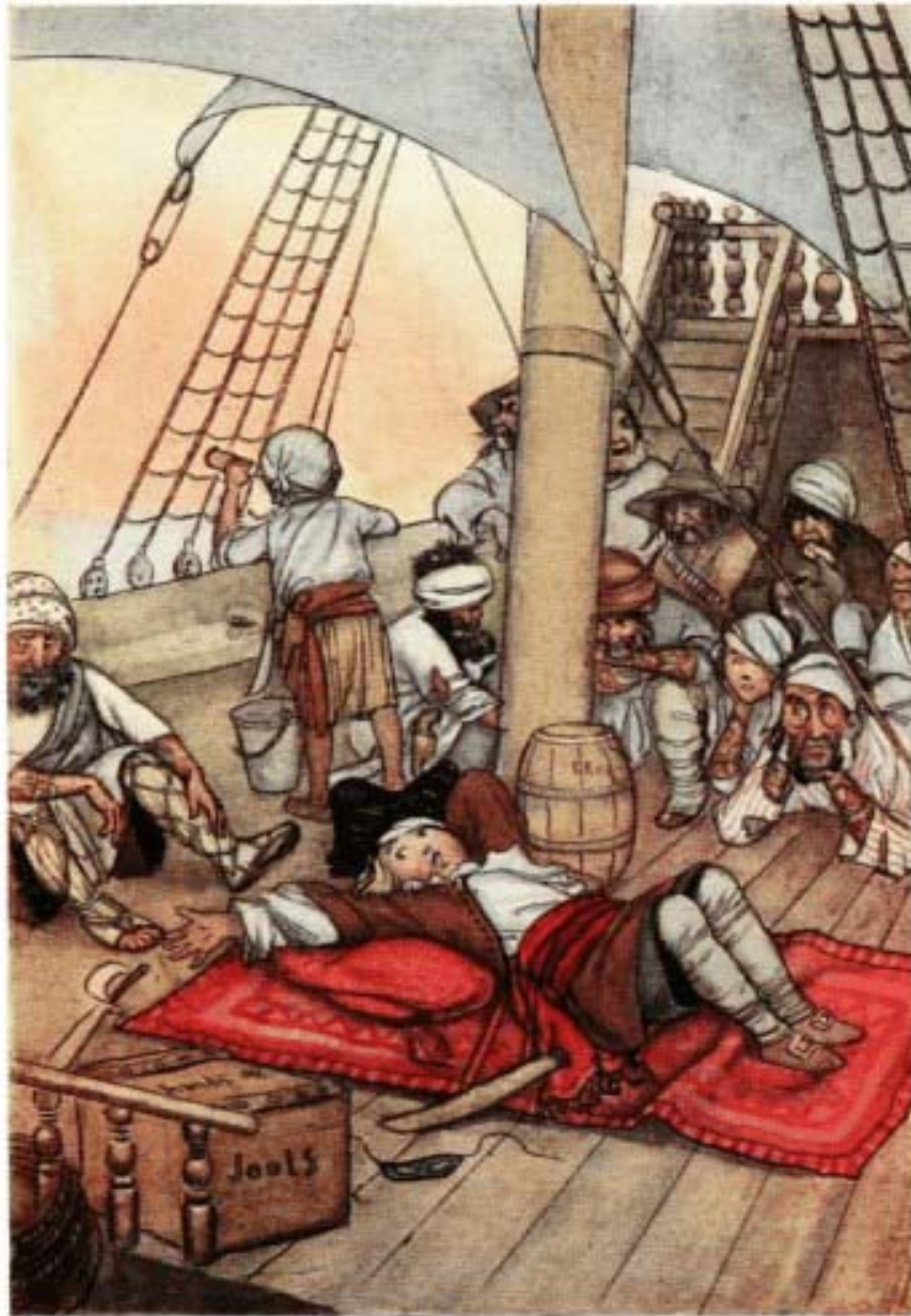
"His crew lay grouped around him"

"This adventure belongs to me," said Boldheart. "Boy, my harpoon. Let no man follow;" and leaping alone into his boat, the captain rowed with admirable dexterity in the direction of the monster.