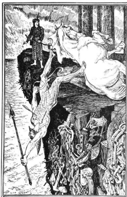
THE OVERTHROW OF THE BRAZEN HORSEMAN

Having uttered these words the vision left me, and I woke, much comforted. I sprang up and drew the bow and arrows out of the ground, and with the third shot the horseman fell with a great crash into the sea, which instantly began to rise, so rapidly, that I had hardly time to bury the horse before the boat approached me. I stepped silently in and sat down, and the metal man pushed off, and rowed without stopping for nine days, after which land appeared on the horizon. I was so overcome with joy at this sight that I forgot all the old man had told me, and cried out, "Allah be praised! Allah be praised!" The words were scarcely out of my mouth when the boat and man sank from beneath me, and left me floating on the surface. All that day and the next night I swam and floated alternately, making as well as I could for the land which was nearest to me. At last my strength began to fail, and I gave myself up for lost, when the wind suddenly rose, and a huge wave cast me on a flat shore. Then, placing myself in safety, I hastily spread my clothes out to dry in the sun, and flung myself on the warm ground to rest.