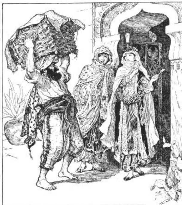
THE MAN IS ASTONISHED AT THE BEAUTY OF THE PORTERESS

The lady soon stopped before a closed door, at which she knocked. It was opened by an old man with a long white beard, to whom the lady held out money without speaking. The old man, who seemed to understand what she wanted, vanished into the house, and returned bringing a large jar of wine, which the porter placed in his basket. Then the lady signed to him to follow, and they went their way. The next place she stopped at was a fruit and flower shop, and here she bought a large quantity of apples, apricots, peaches, and other things, with lilies, jasmine, and all sorts of sweet-smelling plants. From this shop she went to a butcher's, a grocer's, and a poulterer's, till at last the porter exclaimed in despair, "My good lady, if you had only told me you were going to buy enough provisions to stock a town, I would have brought a horse, or rather a camel." The lady laughed, and told him she had not finished yet, but after choosing various kinds of scents and spices from a druggist's store, she halted before a magnificent palace, at the door of which she knocked gently.