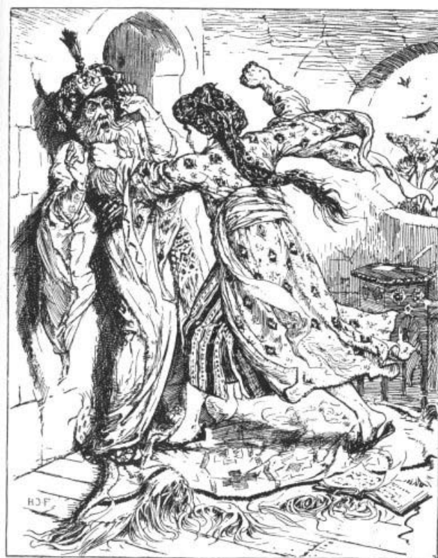
CAMARALZAMAN ILL-TREATS THE GRAND-VIZIR

He then gave an exact account of his interview with Camaralzaman and of the prince's fury when told that it was not possible for any lady to have entered his room, and of the treatment he himself had received. The king, much distressed, determined to clear up the matter himself, and, ordering the vizir to follow him, set out to visit his son.