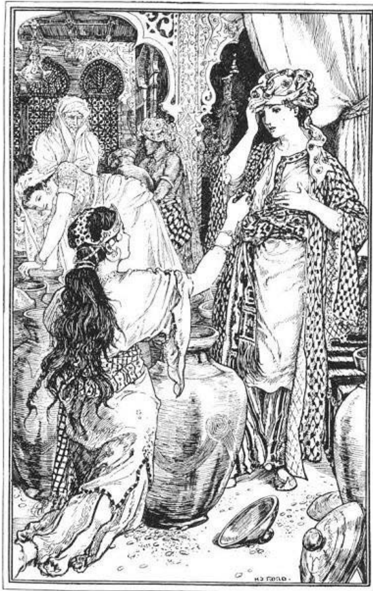
THE TALISMAN IS DISCOVERED IN ONE OF THE JARS (Frontispiece)