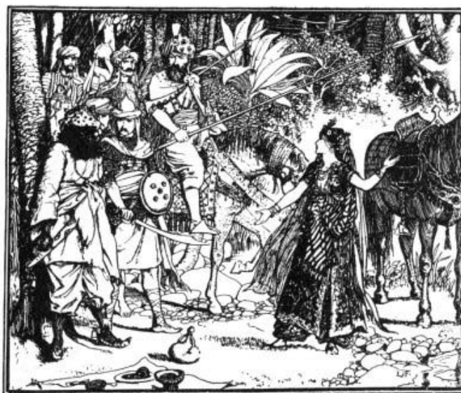
THE SULTAN OF CASHMERE RESCUES THE PRINCESS OF BENGAL FROM THE INDIAN

When the King of Cashmere had quitted her presence the evening before, he had resolved that the sun should not set again without the princess becoming his wife, and at daybreak proclamation of his intention was made throughout the town, by the sound of drums, trumpets, cymbals, and other instruments calculated to fill the heart with joy. The Princess of Bengal was early awakened by the noise, but she did not for one moment imagine that it had anything to do with her, till the Sultan, arriving as soon as she was dressed to inquire after her health, informed her that the trumpet blasts she heard were part of the solemn marriage ceremonies, for which he begged her to prepare.