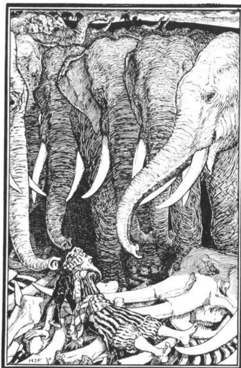
SINDAD LEFT BY THE ELEPHANTS IN THEIR BURIAL PLACE

me up gently enough, set me upon its back, where I clung more dead than alive, and followed by the whole herd turned and crashed off into the dense forest. It seemed to me a long time before I was once more set upon my feet by the elephant, and I stood as if in a dream watching the herd, which turned and trampled off in another direction, and were soon hidden in the dense underwood. Then, recovering myself, I looked about me, and found that I was standing upon the side of a great hill, strewn as far as I could see on either hand with bones and tusks of elephants. "This then must be the elephants' burying place," I said to myself, "and they must have brought me here that I might cease to persecute them, seeing that I want nothing but their tusks, and here lie more than I could carry away in a lifetime."