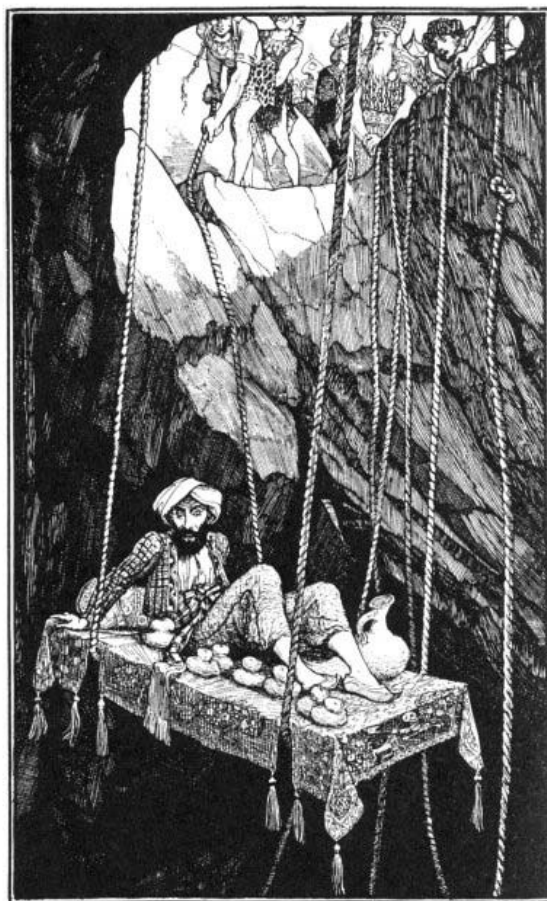
SINDBAD LOWERED INTO THE CAVERN

When the place of interment was reached the corpse was lowered, just as it was, into a deep pit. Then the husband, bidding farewell to all his friends, stretched himself upon another bier, upon which were laid seven little loaves of bread and a pitcher of water, and he also was let down--down--down to the depths of the horrible cavern, and then a stone was laid over the opening, and the melancholy company wended its way back to the city.