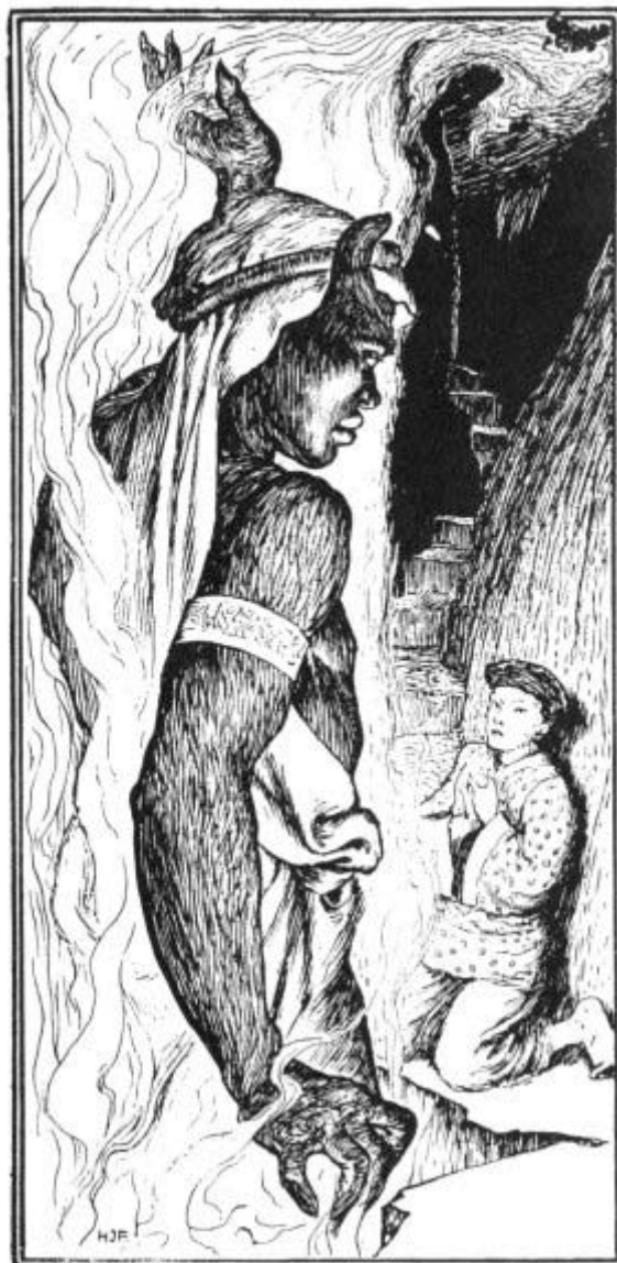
THE SLAVE OF THE RING APPEARS TO ALADDIN

"Go down," said the magician; "at the foot of those steps you will find an open door leading into three large halls. Tuck up your gown and go through them without touching anything, or you will die instantly. These halls lead into a garden of fine fruit trees. Walk on till you come to a niche in a terrace where stands a lighted lamp. Pour out the oil it contains and bring it to me."