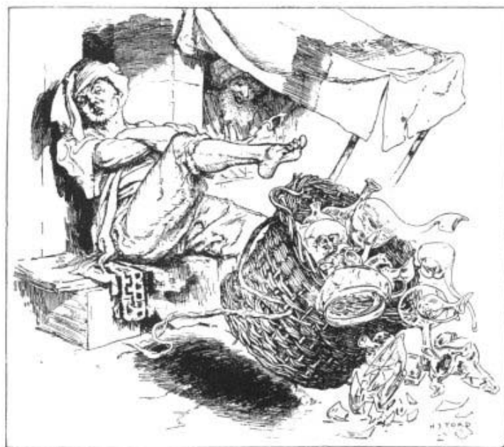
ALNASCHAR KICKS OVER HIS BASKET