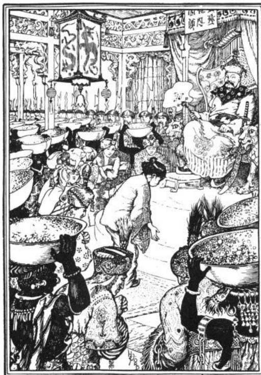
ALADDIN'S MOTHER BRINGS THE SLAVES WITH THE FORTY BASINS OF GOLD BEFORE THE SULTAN

"Not so long, mother, as you think," her son replied "I would do a great deal more than that for the princess."