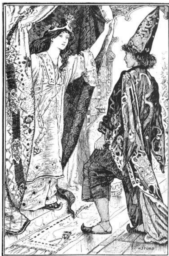
BADOURA RECOGNISES CAMARALZAMAN

"If you really can cure, it is immaterial when you do it. Your fame will be equally great."