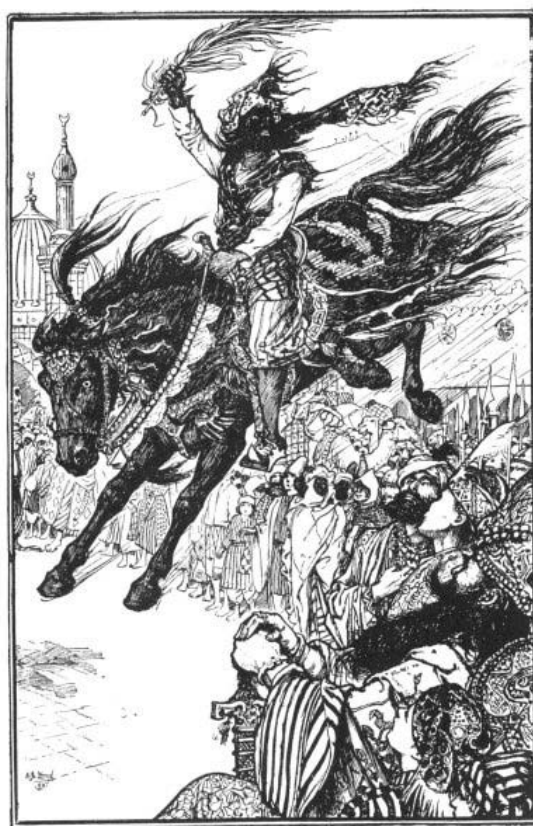
THE INDIAN SHOWS OFF THE ENCHANTED HORSE BEFORE THE KING OF PERSIA

"Sire," returned the Indian, "it is not of his outward form that I would speak, but of the use that I can make of him. I have only to mount him, and to wish myself in some special place, and no matter how distant it may be, in a very few moments I shall find myself there. It is this, Sire, that makes the horse so marvellous, and if your Highness will allow me, you can prove it for yourself."