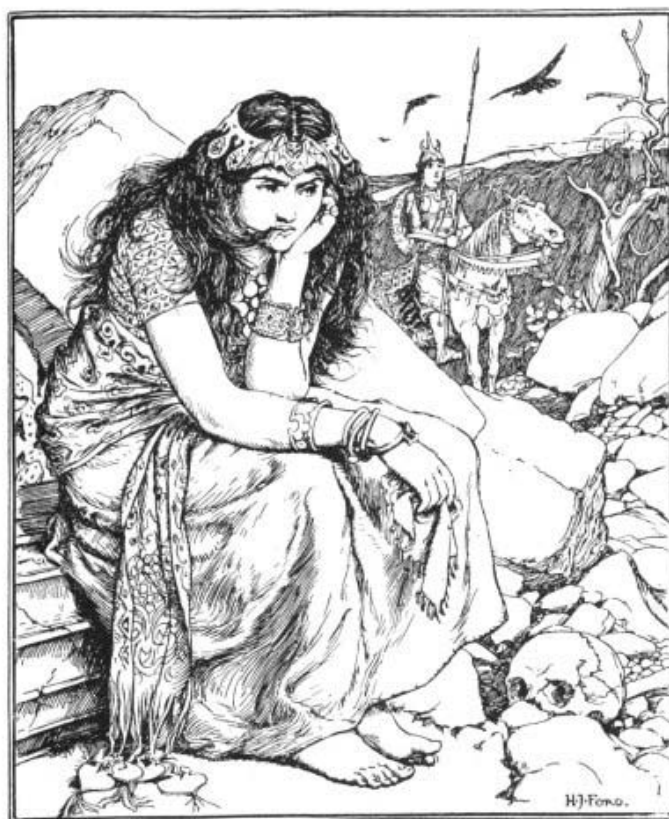
THE PRINCE FALLS IN WITH THE OGRESS

The prince at once saw the danger he was in.