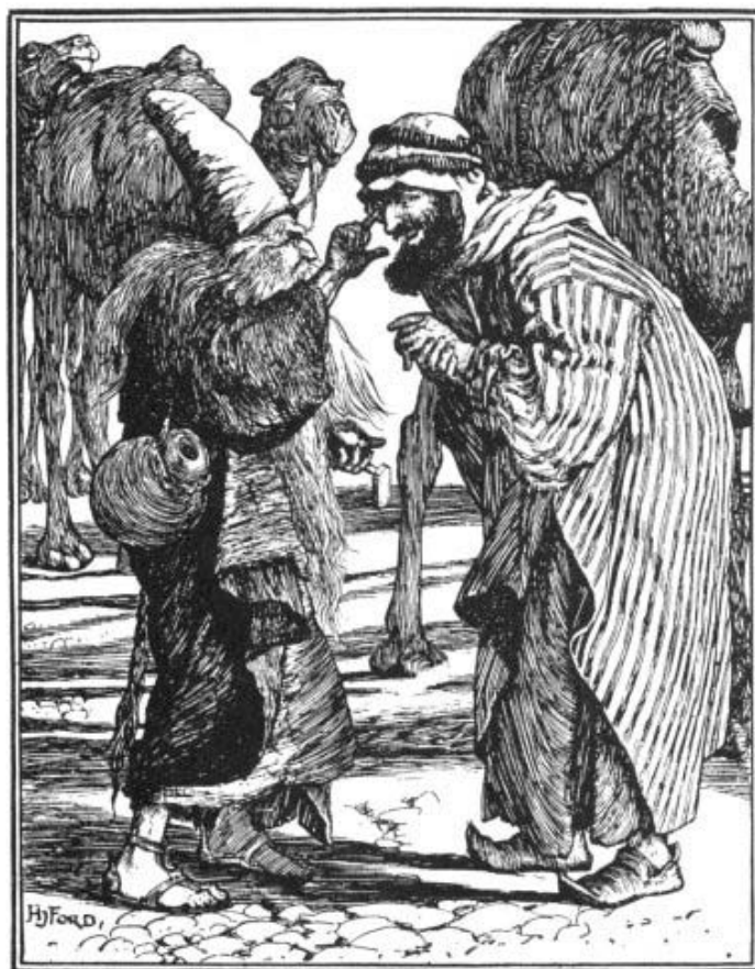
THE DERVISH ANOINTS THE RIGHT EYE OF BABA-ABDALLA

The dervish said no more and left me, speechless with shame and confusion, and so wretched that I stood rooted to the spot, while he collected the eighty camels and proceeded on his way to Balsora. It was in vain that I entreated him not to leave me, but at least to take me within reach of the first passing caravan. He was deaf to my prayers and cries, and I should soon have been dead of hunger and misery if some merchants had not come along the track the following day and kindly brought me back to Bagdad.