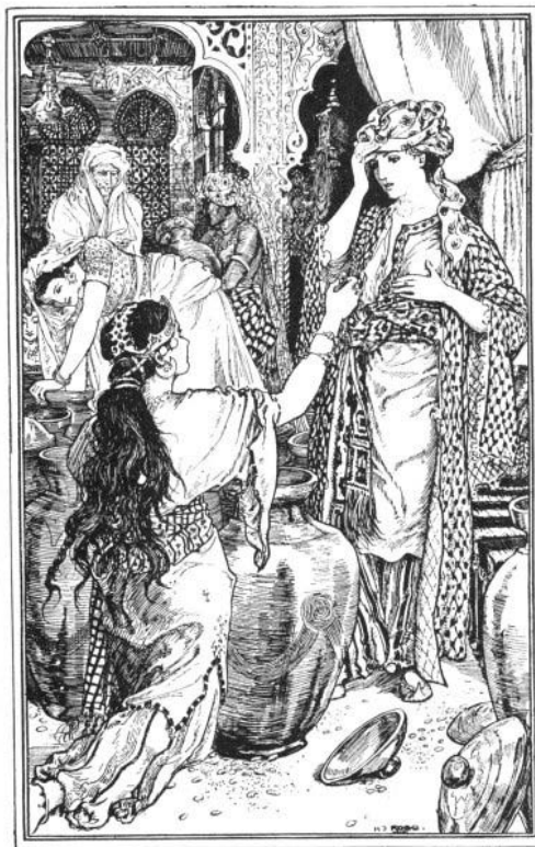
THE TALISMAN IS DISCOVERED IN ONE OF THE JARS

So saying she gave orders for the payment and returned to the palace, having the jars carried before her. When evening came the Princess Badoura retired to the inner part of the palace, and going to the apartments of the Princess Haiatelnefous she had the fifty jars of olives brought to her. She opened one to let her friend taste the olives and to taste them herself, but great was her surprise when, on pouring some into a dish, she found them all powdered with gold dust. "What an adventure! how extraordinary!" she cried. Then she had the other jars opened, and was more and more surprised to find the olives in each jar mixed with gold dust.