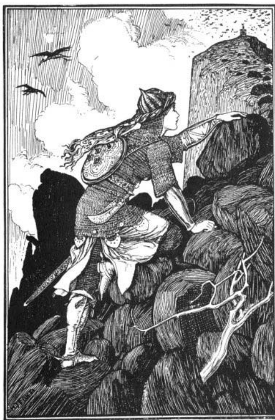
THE PRINCESS CLIMBS OVER THE BLACK STONES

When the Princess Parizade held in her hands the three wonders promised her by the old woman, she said to the bird: "All that is not enough. It was owing to you that my brothers became black stones. I cannot tell them from the mass of others, but you must know, and point them out to me, I beg you, for I wish to carry them away."