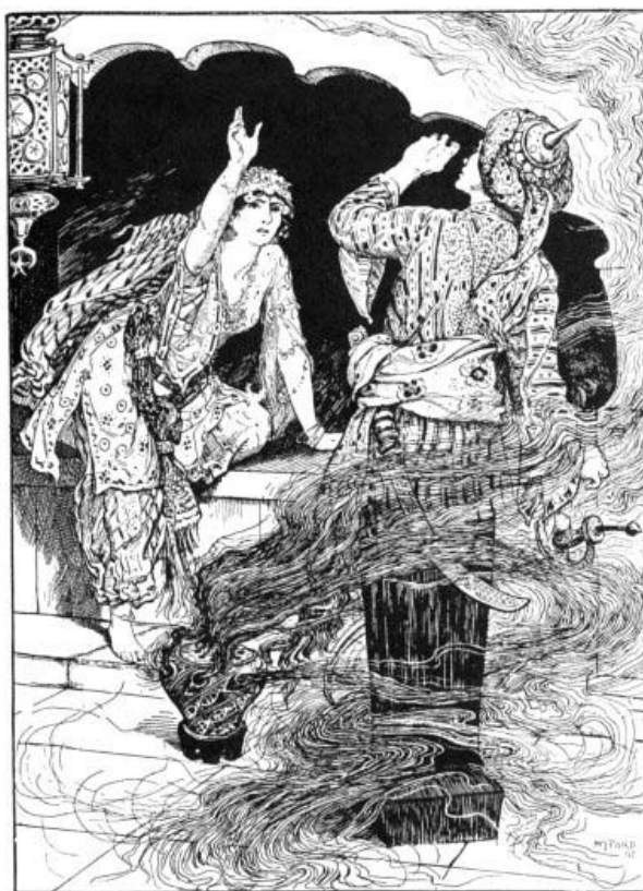
I BECAME HALF MAN AND HALF MARBLE

At last I begged her to cease grieving for him, for although he could not speak or move, by her enchantments she just kept him alive. She turned upon me in a rage, and said over me some magic words, and I instantly became as you see me now, half man and half marble. Then this wicked enchantress changed the capital, which was a very populous and flourishing city, into the lake and desert plain you saw.