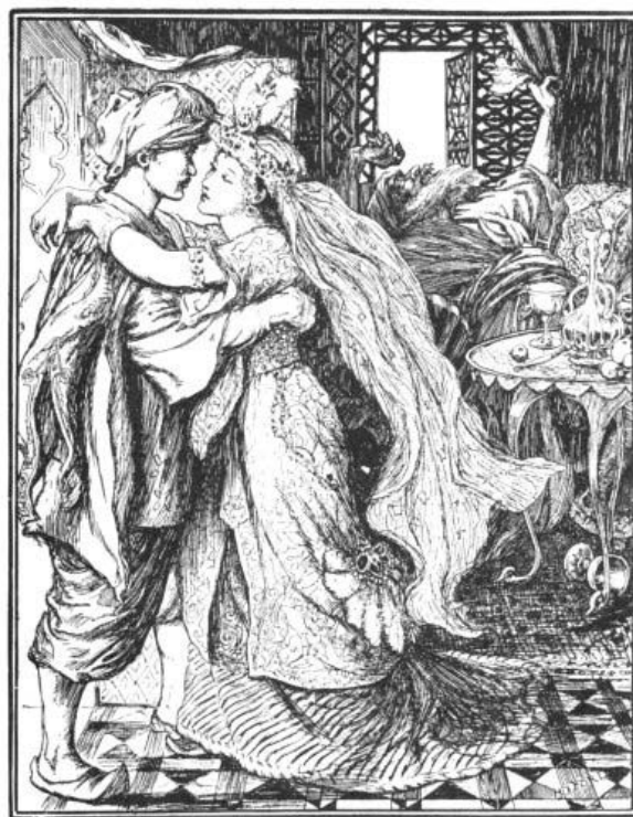
THE DEATH OF THE AFRICAN MAGICIAN

The princess then opened the door to Aladdin, and flung her arms round his neck, but Aladdin put her away, bidding her to leave him, as he had more to do. He then went to the dead magician, took the lamp out of his vest, and bade the genie carry the palace and all in it back to China. This was done, and the princess in her chamber only felt two little shocks, and little thought she was at home again. The Sultan, who was sitting in his closet, mourning for his lost daughter, happened to look up, and rubbed his eyes, for there stood the palace as before! He hastened thither, and Aladdin received him in the hall of the four-and-twenty windows, with the princess at his side. Aladdin told him what had happened, and showed him the dead body of the magician, that he might believe.