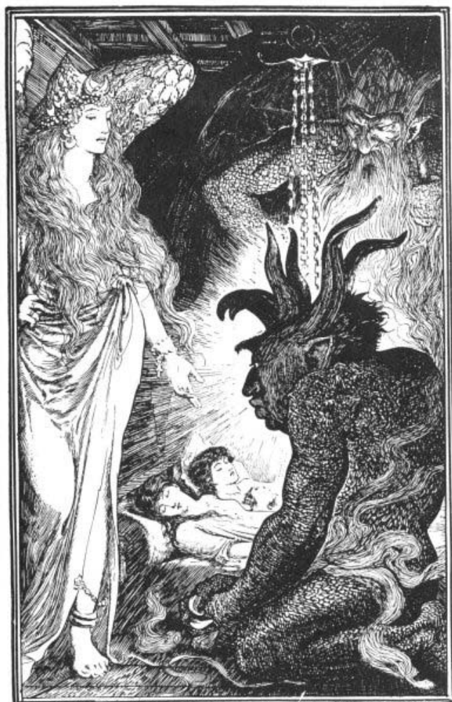
CASCHCASCH IS UNABLE TO DECIDE WHICH IS THE FAIRER

"Oh!" cried the princess. "Why are you so drowsy?" So saying she took his hand and noticed her own ring on his finger, which made her wonder still more. But as he still remained in a profound slumber she pressed a kiss on his cheek and soon fell fast asleep too.