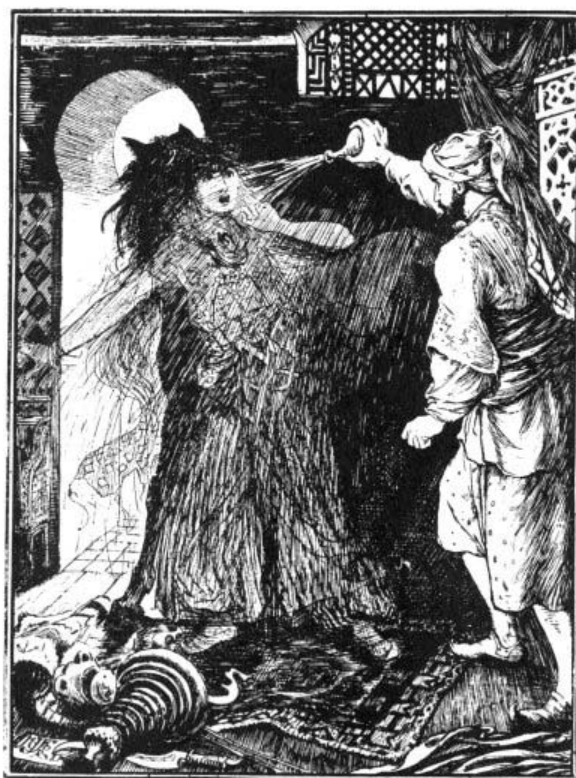
AMINA IS TRANSFORMED INTO A HORSE

"My daughter," she answered, "is, as you see, as accomplished a magician as Amina herself, but you would be astonished at the amount of good she does by her knowledge. That is why I have never interfered, otherwise I should have put a stop to it long ago." As she spoke, her daughter entered with a small bottle in her hand.