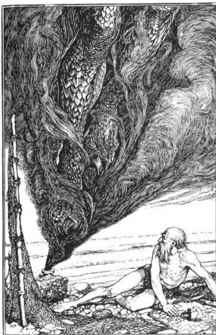
THE GENIUS COMES OUT OF THE JAR

"No," answered the genius; "but that will not prevent me from killing you; and I am only going to grant you one favour, and that is to choose the manner of your death."