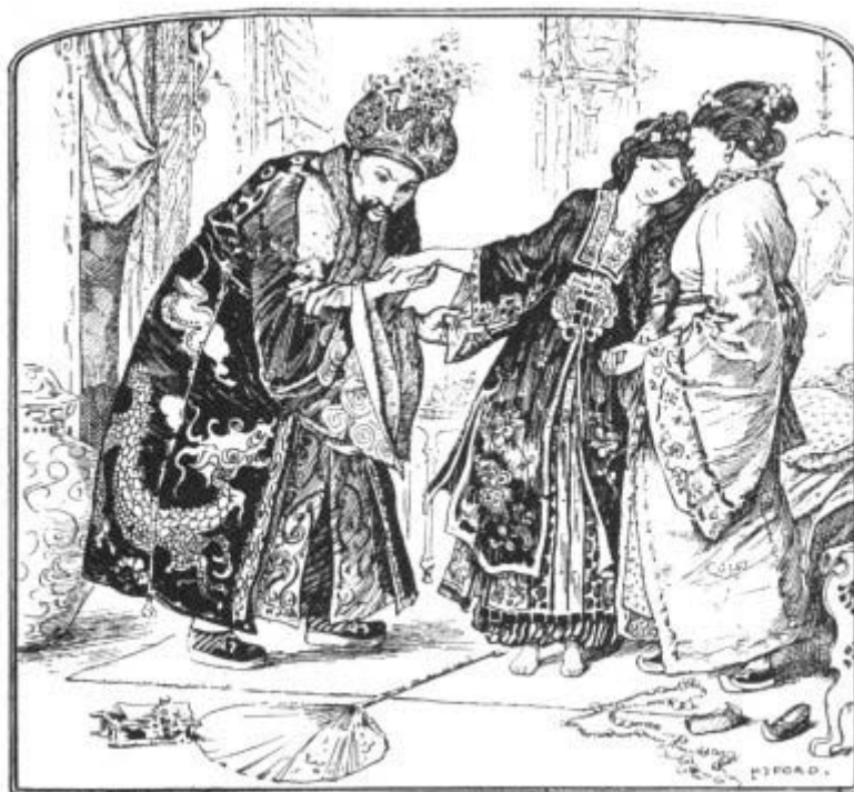
THE KING OF CHINA LOOKS AT THE RING ON THE PRINCESS'S FINGER

The emir, who had expected to hear the princess talk nonsense, finding how calm and reasonable she was, assured the king that he could not venture to undertake a cure, but placed his head at his Majesty's disposal, on which the justly irritated monarch promptly had it cut off.