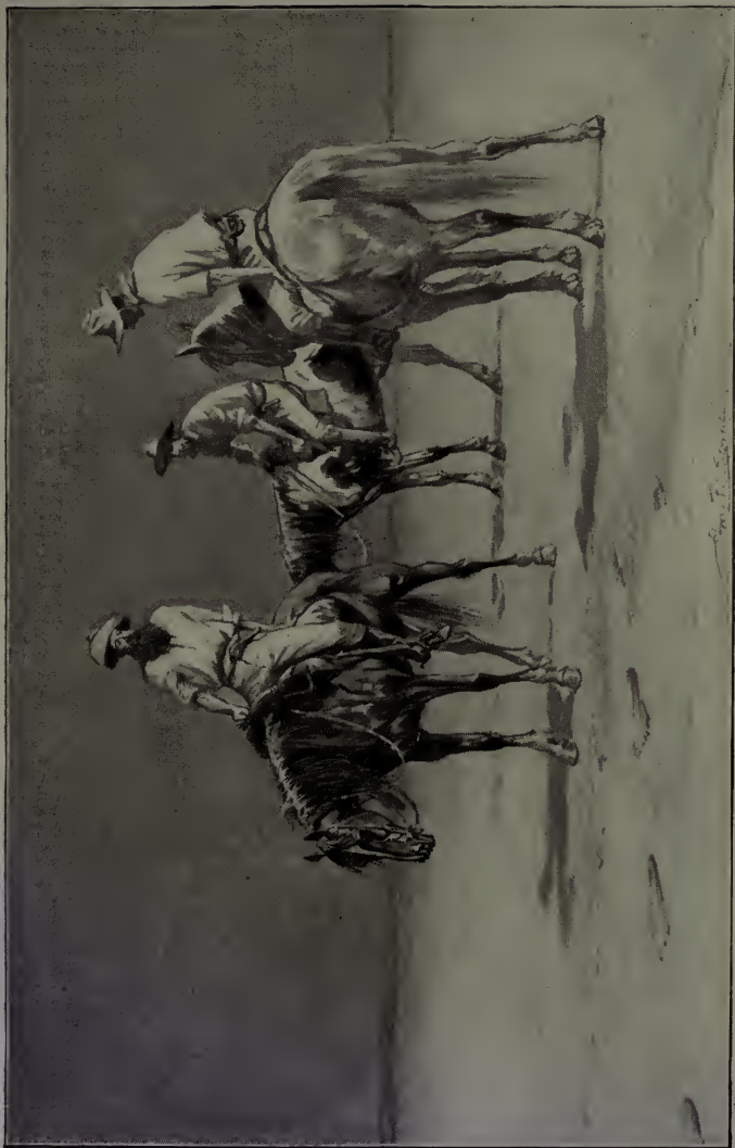
THEY FIND THE DEVIL'S TRACK ON THE ROCK-PLAIN