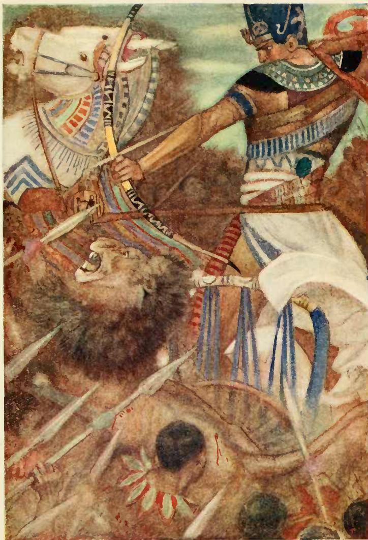
Rameses II defeating the Khetans