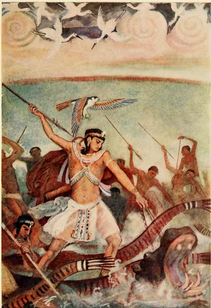
Horus in Battle