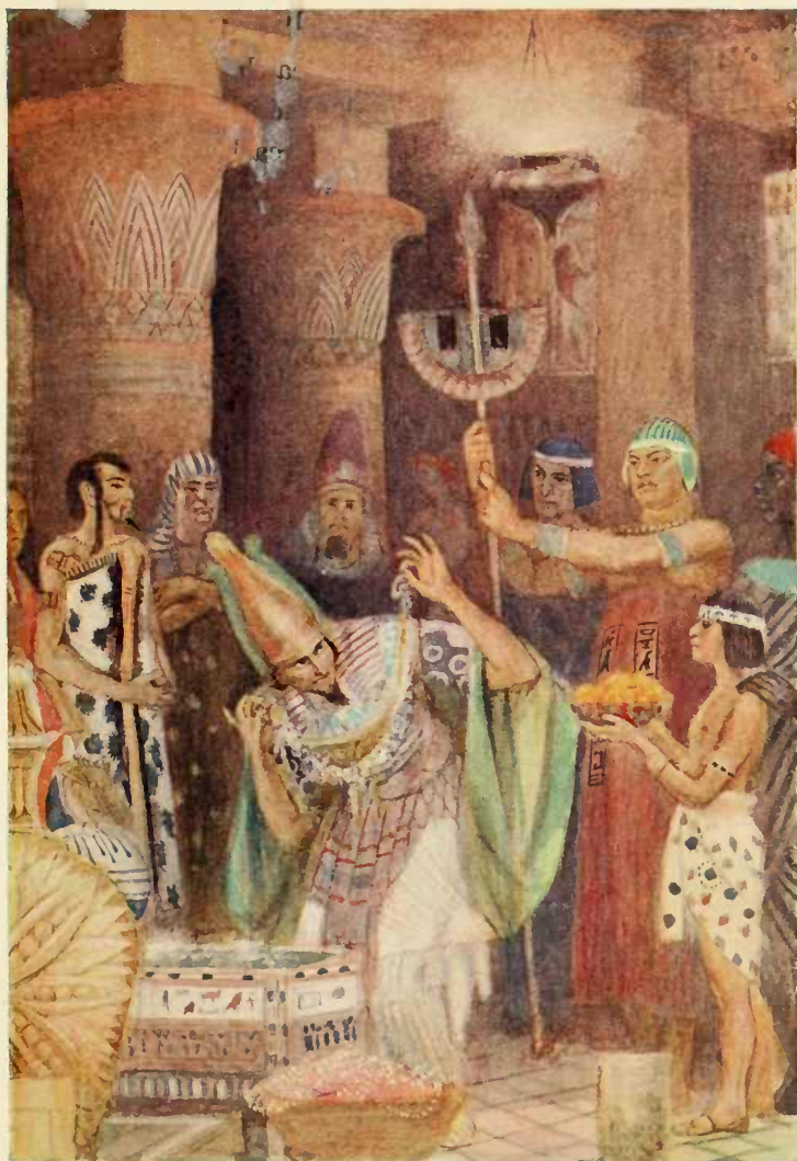
The Treasure-chamber of Rhamphinitus