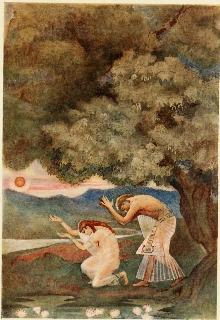
The Coming of Osiris and Isis Digitized by Microsoft®