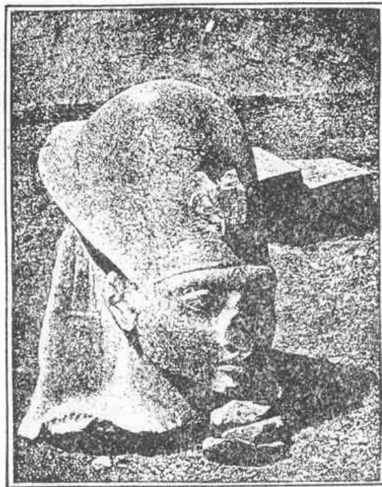
"An Ancient Cushite. RAMESES II, SURNAMED "THE GREAT." From a group in red granite. Tanis. "}