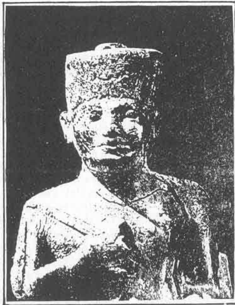
KHUFU, BUILDER OF THE GREAT PYRAMID. (From Petrie's "Abydos," Part II.)

Dynasty IV was 3700 B. C. Recent excavations have enabled us to look upon the face of Khufu. He possessed a giant Ethiopian profile. Petrie says of him: "The first thing that strikes us about him is the enormous driving power of the man, the ruling nature which it seems impossible to resist. As far as force of will goes, the strongest characters of history would look pliable in his presence. There is no face quite parallel to this in all the portraits that we know--Egyptian, Greek, Roman or modern." Myers says that these figures standing so far back in the gray dawn of the historic morning mark not the beginning but in some respects the perfection of Egyptian art. It is this vast and mysterious background that impresses us more than these giant forms cast up against it. The ancient Cushite looks at you out of the face of Khufu. Examination of the countenances of any of these first Pharaohs reveals all of the true Ethiopian types and there was more than one of them. Their parallels may easily be found in Ethiopian types around us today.