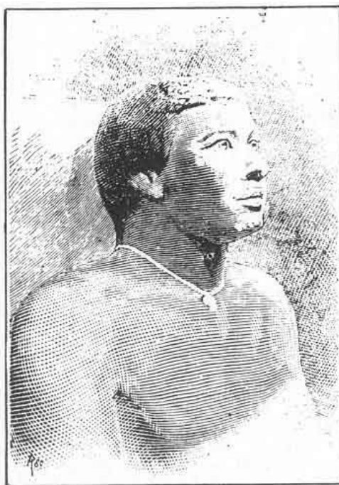
RACE TYPE OF THE EARLY DYNASTIES. (From Ridpath's History.)

The pictures on the Egyptian monuments reveal that Ethiopians were the builders. They, not the Egyptians, were the master-craftsmen of the earlier ages. The first courses of the pyramids were built of Ethiopian stone. The Cushites were a sacerdotal or priestly race. There was a religious and astronomical significance in the position and shape of the pyramids. Dubois points to the fact that in Upper Egypt there were pictured black priests who were conferring upon red Egyptians, the instruments and symbols of priesthood. Ethiopians in very early ages had an original and astounding religion, which included the rite of human sacrifice. It lingered on in the early life of Greece and Rome. Dowd explains this rite in this way: "The African offered his nearest and dearest, not from depravity but from a greater love for the supreme being." The priestly caste was more influential upon the Upper Nile than in Egypt. With the withdrawal of the Ethiopian priesthood from Egypt to Napata, the people of the Lower Nile lost the sense of the real meaning of their religion, which steadily deteriorated with their language after their separation from Ethiopia.