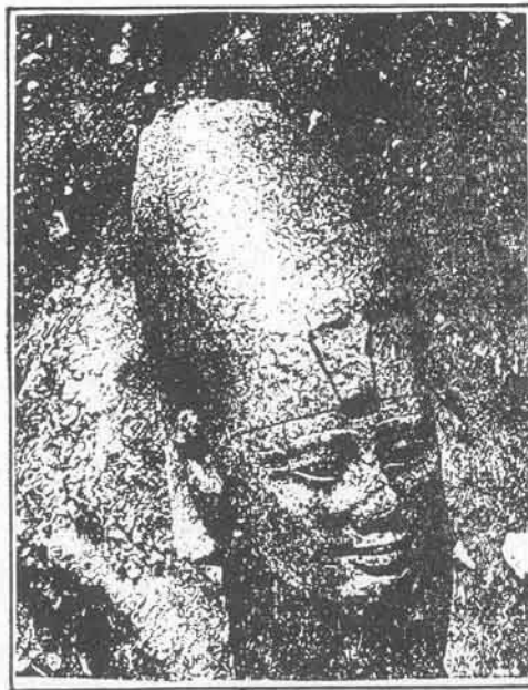
AMENEHAT I. (TWELFTH DYNASTY.)

Colossal head in red granite, from the ruins of the Great Temple of Tanis.