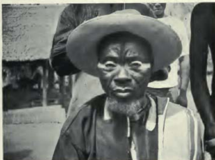
AN IBIBIO CHIEF

As will be found related under "Burial Customs" (p. 232), the oracle was usually consulted after the death of a chief in order to discover whether this had been brought