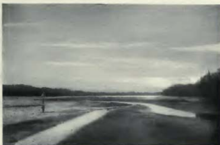
A NIGERIAN LANDSCAPE: MUD FLATS LEFT DRY BY THE TIDE