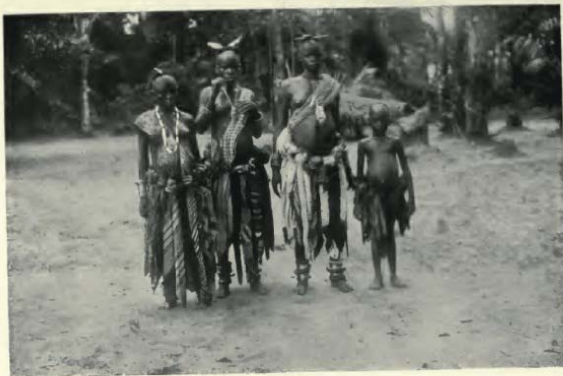
"FATTING-HOUSE" GIRLS AFTER THE FIRST TIME OF SECLUSION (MBOBI)

not the case. The second occasion on which a girl of the last-named tribe enters the Fattening-house is called "Abiana Abiana Nkuawhaw," "The Coming of the Full Breasts." The ceremony is also in preparation for marriage, and, should the girl be already betrothed, as is mostly the case, the bridegroom must now pay the first instalment of dowry, or bride price, called "Nkpaw Nkuawhaw Eyen Owon," i.e. "Small Gifts of Fattening."