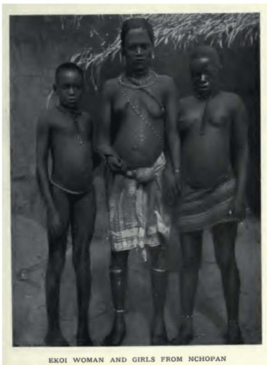
EKOI WOMAN AND GIRLS FROM NCHOPAN