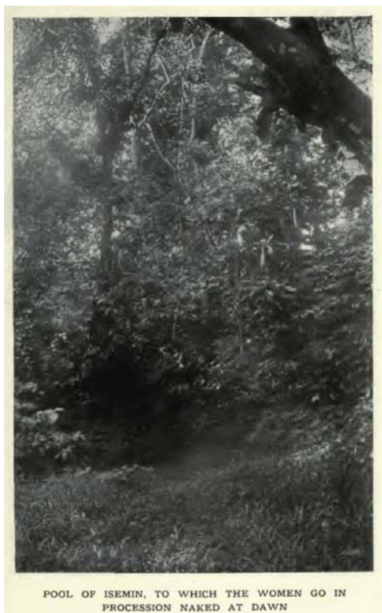
POOL OF ISEMIN, TO WHICH THE WOMEN GO IN PROCESSION NAKED AT DAWN

Again, when the young wife is about to bear her first babe, the husband often goes out and invites other small folk into the house. A meal has been prepared, and while the little guests are busily feasting he calls to his wife, "Just as many piccans are now in our house so may you bear plenty for me, that in time it will be filled with our children!"