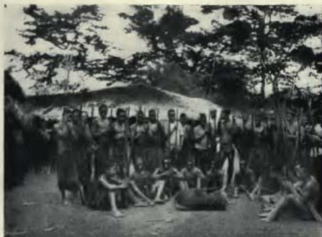
A HUNTING SCENE

heads of dead babes, to be placed in a hole in the rock, dedicated to Eka Abassi, here known as Abassi Isu Ma, i.e. "the goddess of the Face of Love"--or, since by a beautiful connection of thought the word for love and motherhood is the same, the name may also be translated "the Face of the Mother"--praying that she will speedily set the feet of their little ones upon the road back to life. In the sacred fish, too, with which all holy pools and streams abound, the souls of dead ancestors are thought to dwell, waiting for reincarnation. Unlike Central Australians, however, as reported by Sir James Frazer, Ibibio women--like their far-off sisters of Banks Island--are well aware that without mortal father no earth-child can be born. Yet, while the body of the new-comer is clearly attributed to natural causes, its spirit is thought to be that of the "affinity," either animal or vegetable, with which one or other of its parents was mysteriously linked; or of an ancestor, returned to earth in this new guise.