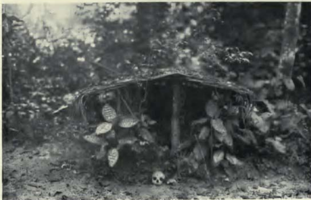
A JUJU SHRINE, WITH JUJU LEAVES IN THE FOREGROUND

produces the crops to nourish her children in life, and provides their last long resting-place when work is done." 3