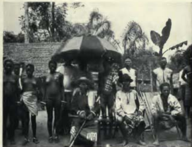
IBIBIO CHIEFS, WITH ATTENDANTS

Among those few, however, who still keep in their hearts, jealously guarded, the secret which has come down from times when woman, not man, was the dominant sex--that