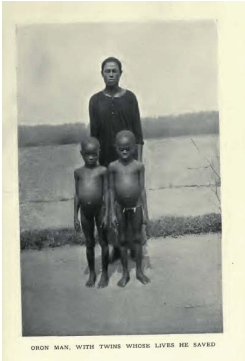
ORON MAN, WITH TWINS WHOSE LIVES HE SAVED