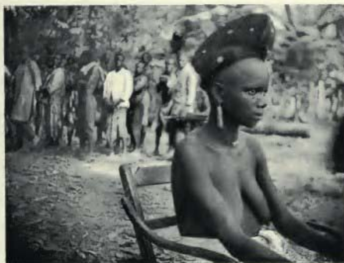
AN IBO WOMAN

"After making this offering, the members went forth to that part of the sacred bush where the juju dresses were kept. There they robed themselves, and then came back, clad in full dress, to give their play in the town.