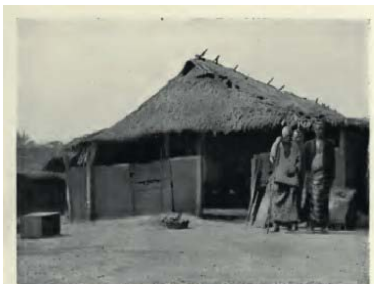
A TYPICAL EGBO HOUSE