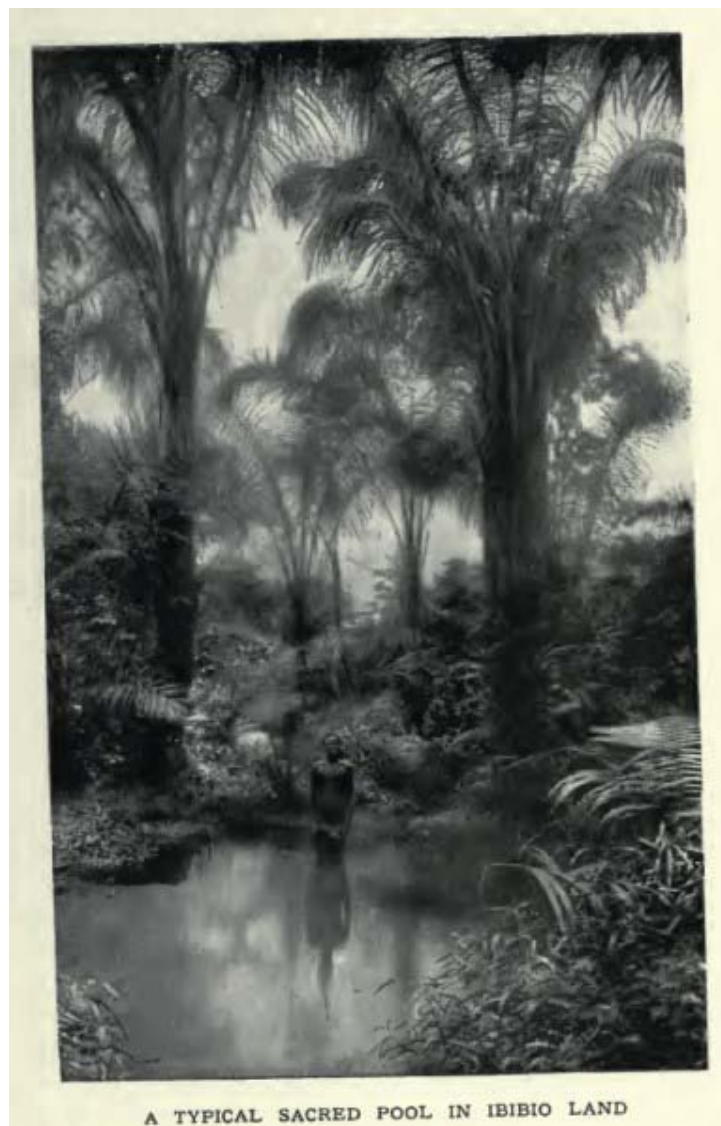
A TYPICAL SACRED POOL IN IBIBIO LAND

"Behold! Here comes your child who is about to enter the Fatting-house. Protect her that no evil thing may have power to harm her while she dwells therein."