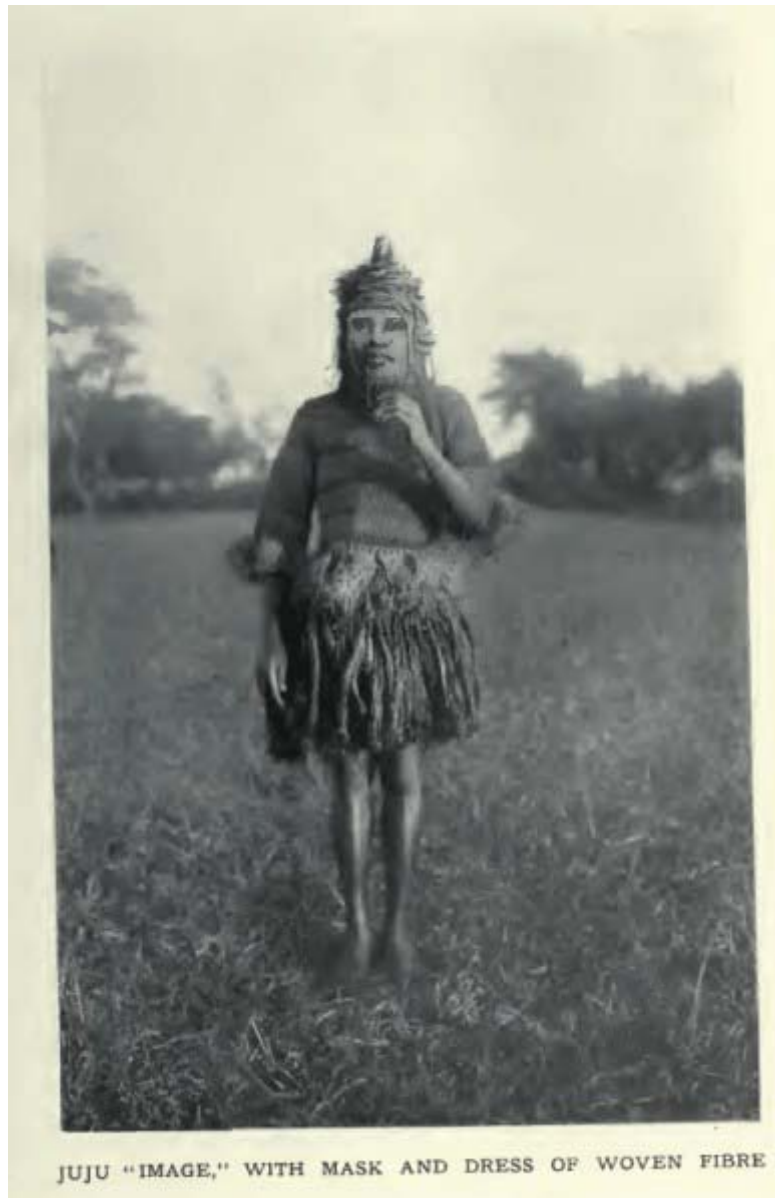
JUJU "IMAGE," WITH MASK AND DRESS OF WOVEN FIBRE

The prohibition would seem to have come down from a time when the maidens of the tribe were more carefully guarded than at the present day. It was confided to me by one of my women informants, with the explanation that this also was among the mysteries which must be kept from male knowledge; since, should a man of lowly birth who wished to secure for himself alliance with the family of some powerful chief learn the secret, he would only have to single out an infant bride from among the daughters of such a house, and after having secured a set of Nyawhawraw perform certain rites over them and rub them with a particular kind of "medicine." Afterwards he must bribe a woman of the household to see that they were worn by the little maid, and from that time forward it would be impossible for any other man to gain her love.