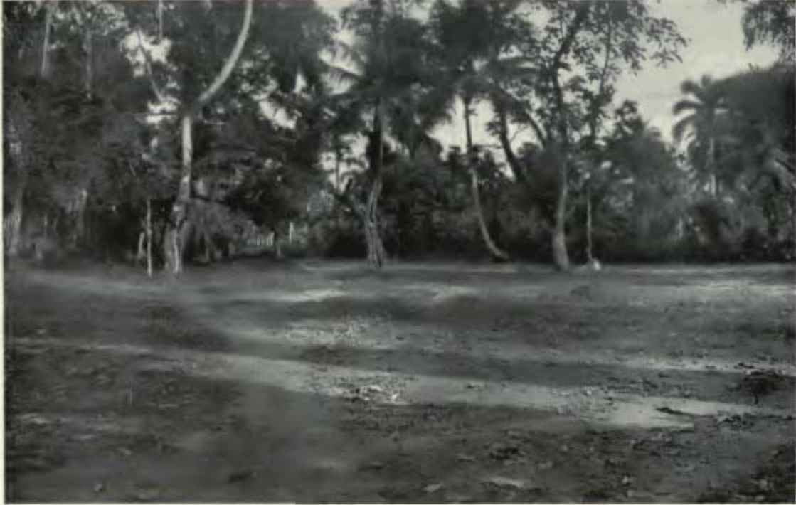
A TOWN PLAYGROUND

In the foregoing story both Ekpenyong and Adiaha were bidden to go down to the water and bathe so that their bodies might be laved from head to foot. This would appear to have been ordered, not only on account of the fertilising powers ascribed to water in this region, but also as a means of breaking the curse of sterility under which both were suffering.