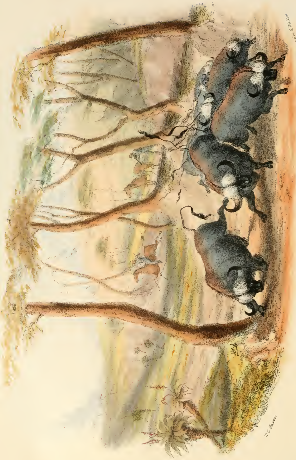
HUNTING THE WILD BUFFALO