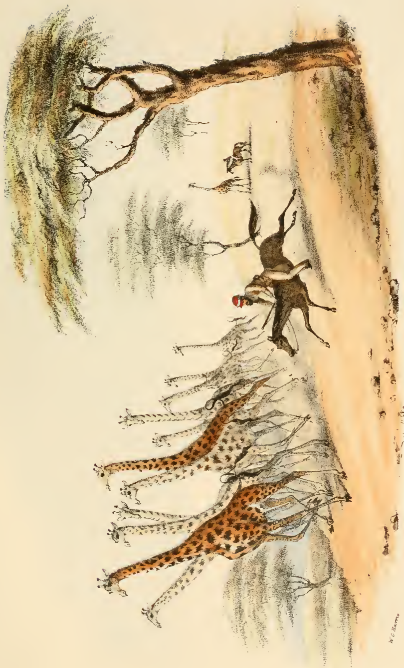
HUNTING THE GIRAFFE