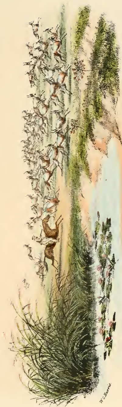
HUNTING THE BLEBOK