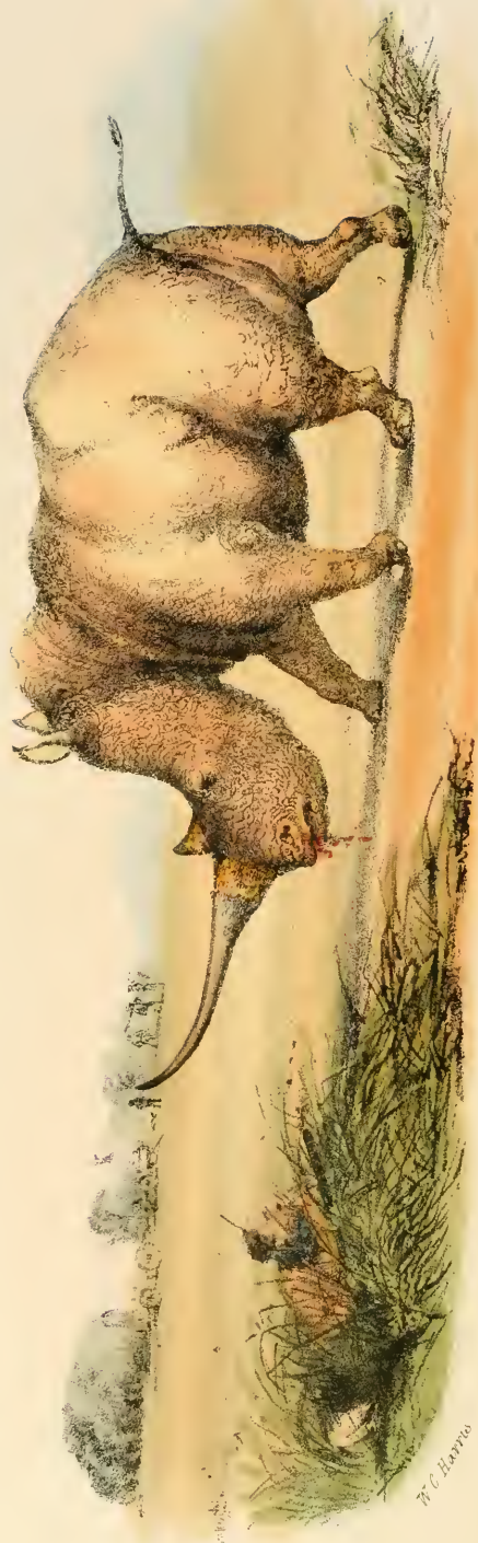
THE WHITE RHINOCEROS