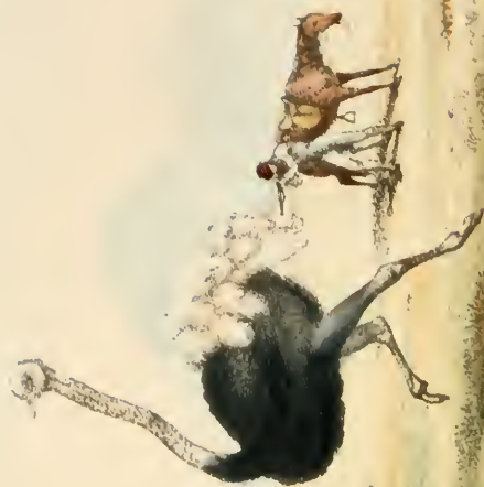
HUNTING THE OSTRICH