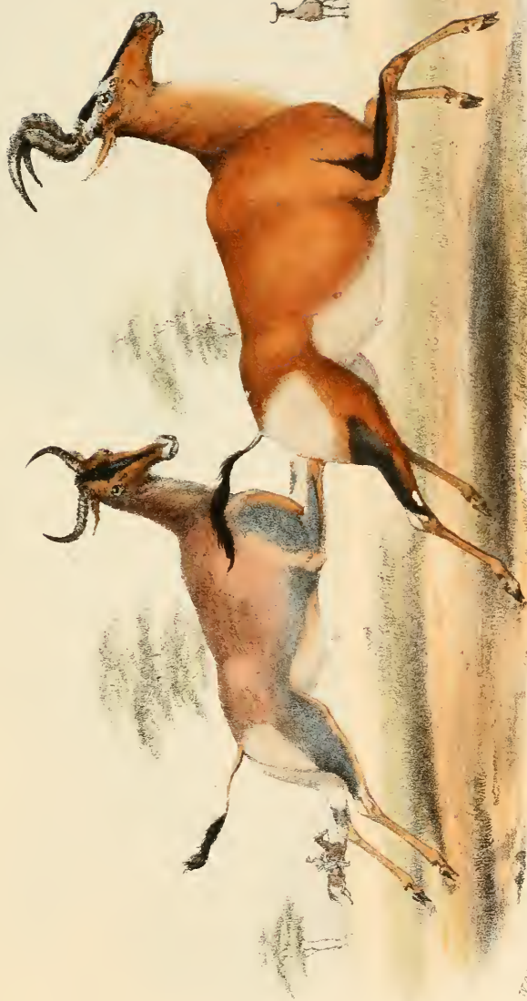
THE SASSAYBE AND HARTEBEEST