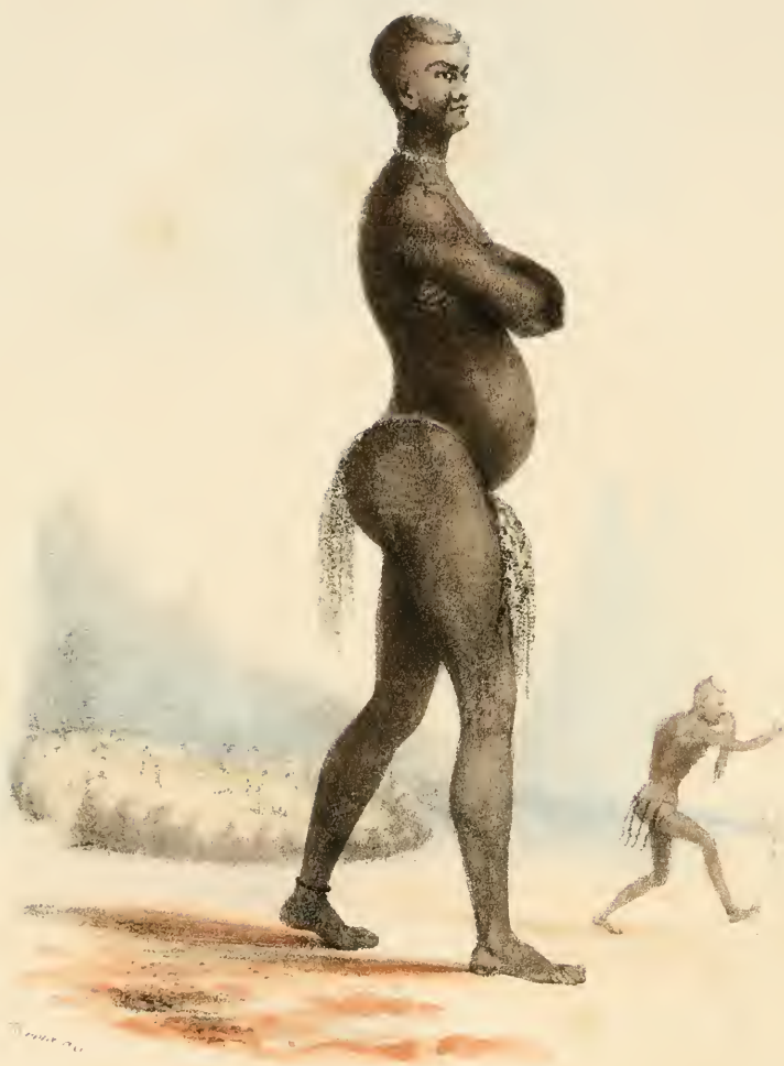
MOSELEKATSE, KING OF THE AMAZOOLOO