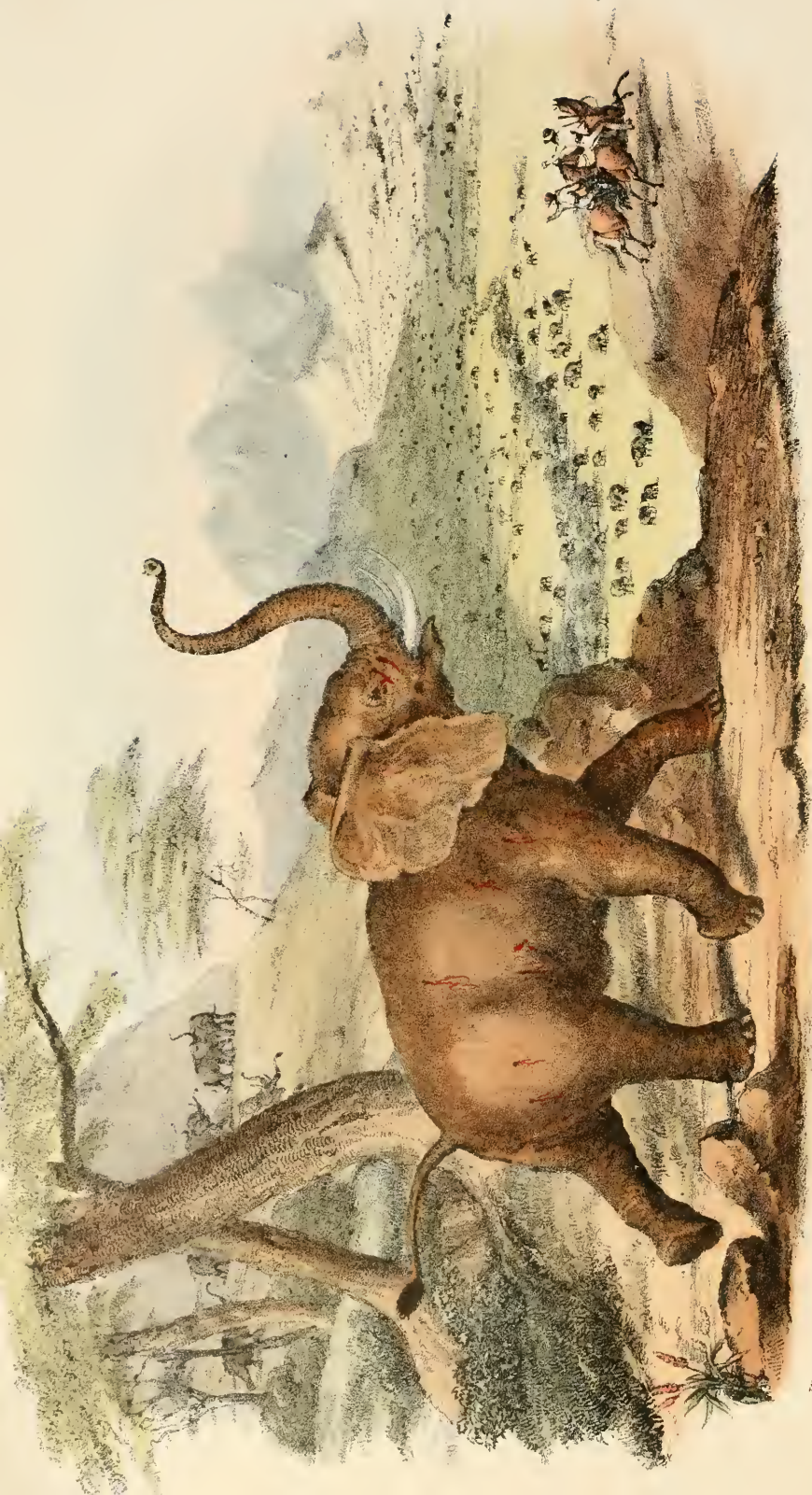
HUNTING THE WILD ELEPHANT