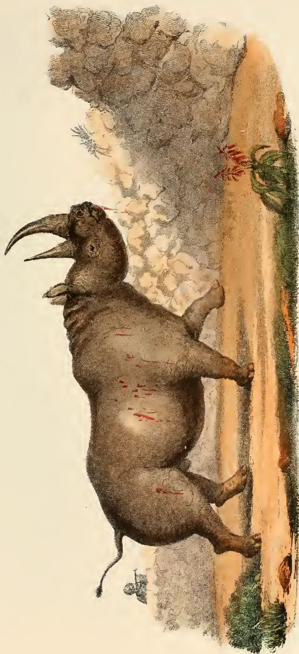
THE BLACK RHINOCEROS