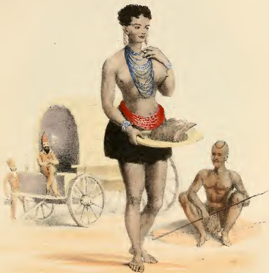
TRUEY, THE GRIQUA MAID.