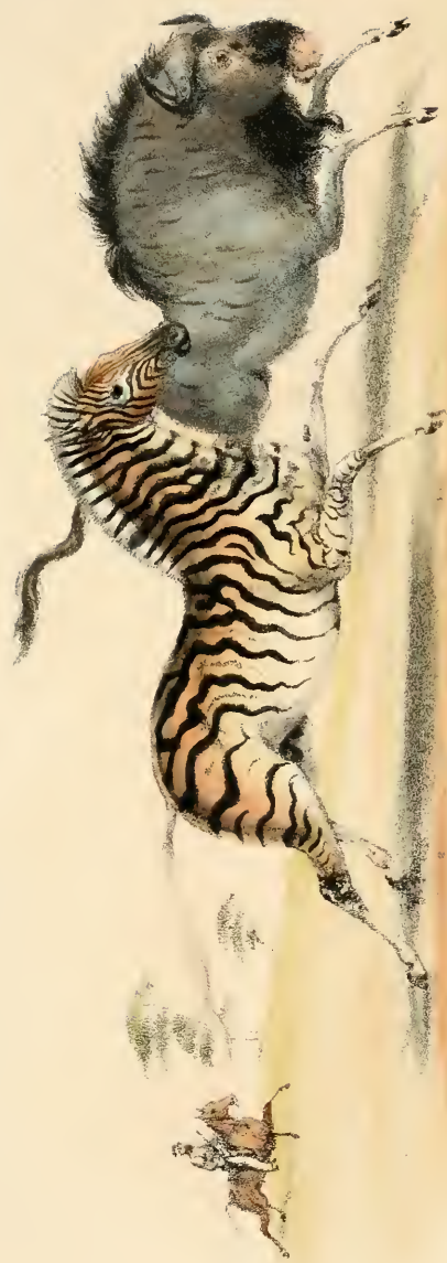
BURCHELL'S ZEBRA AND BRINDLED GUNBOAT