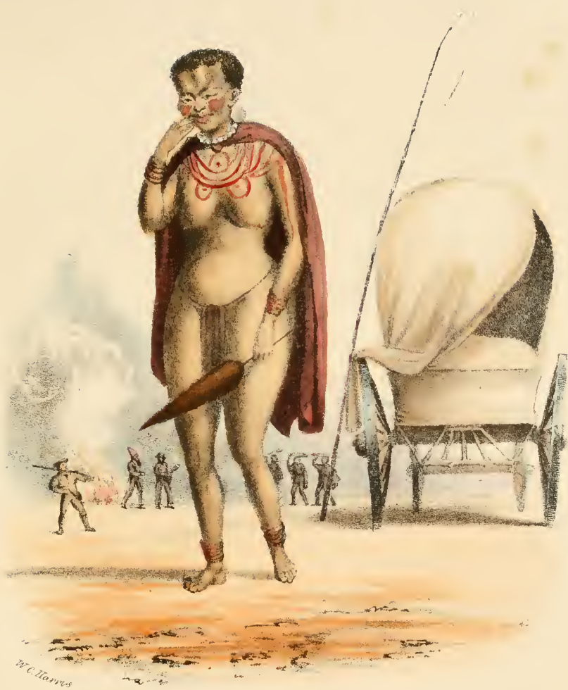
THE PRETTY BUSH GIRL