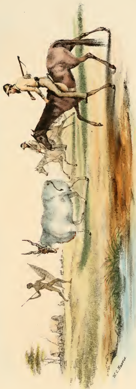
DRIVING IN AN ELAND.